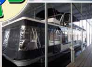
70' SUMERSET, 1994