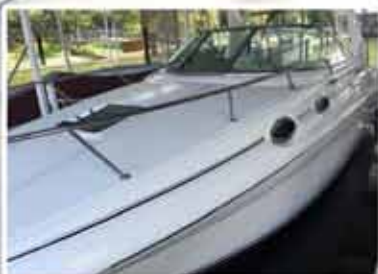
26' SEA RAY, 2004