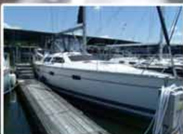
42' HUNTER PASSAGE, 1996