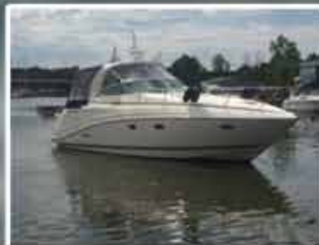
35' RINKER, 2007