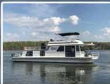
50' GIBSON, 1996