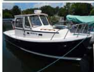
25' ATLAS ACADIA, 1996