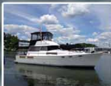
38' BAYLINER, 1989