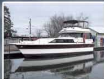
44' TROJAN, 1980