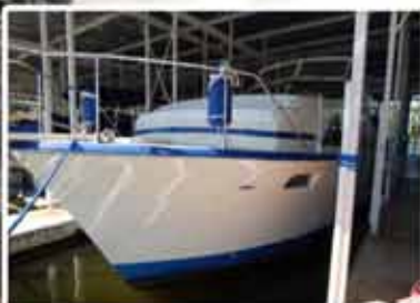
35' CHRIS CRAFT, 1973