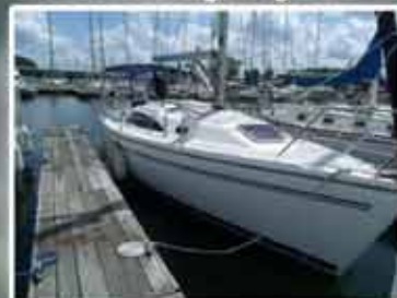
31' CATALINA, 2009