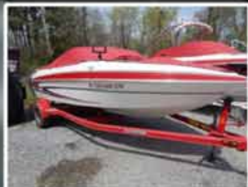
20' GLASTRON, 2009