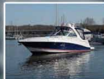
38' FOUR WINNS, 2008